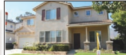
OWNER WILL CARRY SALE/OR FOR LEASE! Charming 2 story in Vintage Highlands of Rancho! 4 BR, 2.5 BA, aprx. 2129 sf. Formal LR, DR, FR w/frplc. Gourmet kit w/nook, mountain views, office with built-in desks & shelves! CALL (909) 373-4400.