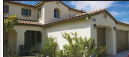
PRISTINE & SPACIOUS HOME w/many upgrades in very desirable gated comm. Turnkey ready! Aprx. 3106 sf, 4 BR, 2.5 BA. Appliances like new! A must see at only $279,000! CALL (909) 373-4400.