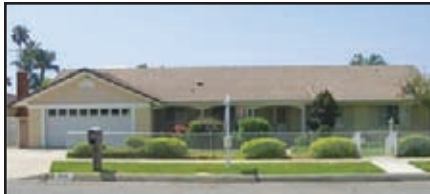
BEAUTIFUL SINGLE STORY RANCH STYLE IN ALTA LOMA! N/210 fwy. 3 BR, 2 BA, large lot, lg. liv. rm. w/frplc, lg. fam. rm. connects to kitchen. RV access. $369,000. CALL (909) 373-4400.