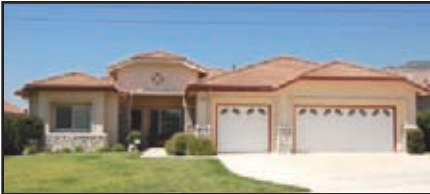
LAS COLINAS SINGLE STORY. Pride of ownership! 4 BR, 3 BA, approx. 1964 sf, 2 fireplaces, cul de sac. $249,000. CALL (909) 373-4400.