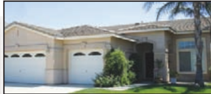
AMAZING SINGLE STORY! 4 BR, 2 BA, aprx. 2057 sf. Diamond cut cer. tile in kit. FR, baths & laundry. Custom paint, plantation shutters & wood blinds. Frplc in lg. FR, newer carpet. Blt-in BBQ with sink in yard. $319,500. CALL (909) 373-4400.