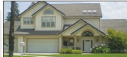
WELL MAINTAINED! 4 BR, 2.5 BA, master w/sitting area, formal LR, DR & fam. rm. with fireplace. Large lot of approx. 15,000 sf, fully landscaped and patio with built-in BBQ. $424,900. CALL (909) 373-4400.